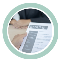
Fair business practices