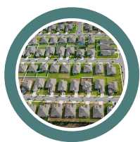
Management of the organization