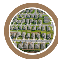
Inclusion and development